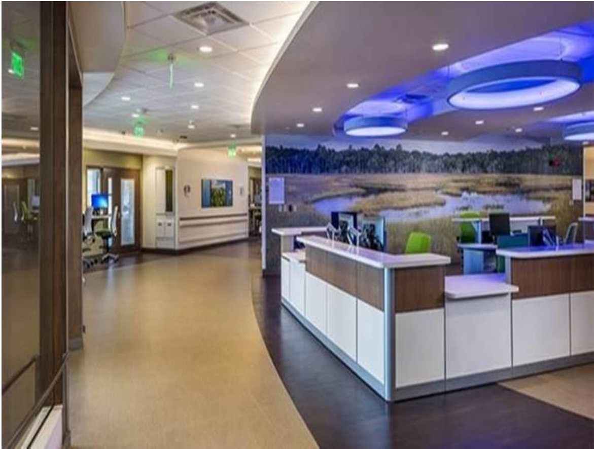
Clinical Bay & Patient/Guest Passage