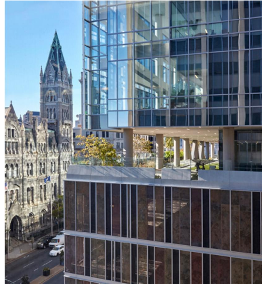
VCU Health System – Children's Outpatient Pavilion