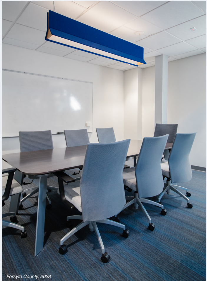
Forsyth County, 2023

S torr understands the unique demands of government workspaces and offers durable, high-performing solutions, utilizing products renowned for their quality and longevity. Our extensive experience with state contracts ensures compliance, efficiency, and a smooth process from start to finish. By choosing Storr, you're not just getting office furniture; you're gaining a strategic partner dedicated to creating flexible, efficient spaces that enhance productivity while meeting your budget and timeline requirements.