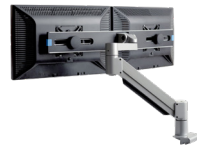
CF Series Monitor Arms