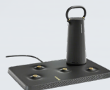
Flex Mobile Power