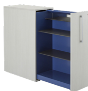
High Density Storage